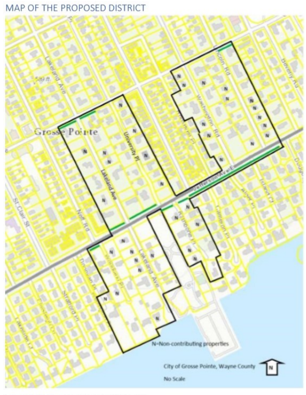
Non-contributing properties marked with an "N"

Green line denotes contributing fence/wall/posts on the south side of East Jefferson